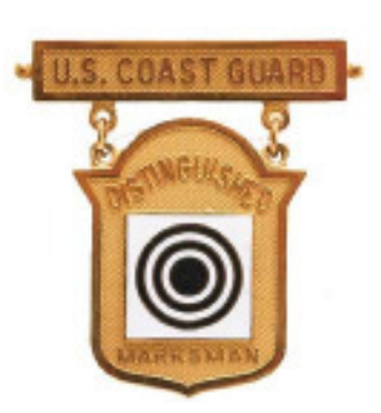
U.S. Coast Guard Distinguished Marksman's Badge

The designation "Distinguished <u>Marksman</u>" inscribed on the badge continued until 1959, when the U.S. Army and the DCM (now the CMP) decided to change the terminology to "Distinguished Rifleman." To those wearing the Distinguished Badge in the 1950s, the term "Distinguished Marksman" seemed a bit archaic. In the 1880s, the term "Marksman" conjured up visions of a man or woman especially skilled with a rifle. By the late 1950s the term "Marksman" usually indicated the lowest rung on the weapons qualification ladder following after Expert and Sharpshooter. When the designation was changed, the Army pushed the Adjutant's Shield up on the suspension bar slightly and added "U.S. Army" to the top bar. Aside from the Army inscription on the suspension bar, the Army and the Civilian badge remain identical. The Naval Service (Navy, Marines and