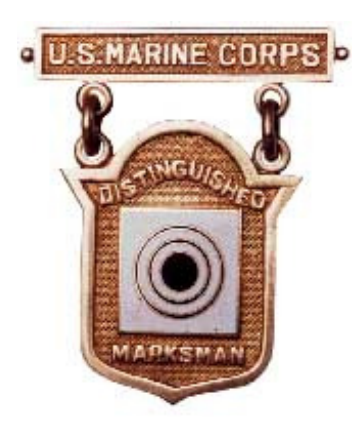
USMC Distinguished Marksman's Badge 1920s - Present

percentage of Non-Distinguished shooters competing in authorized "Leg" or "Excellence in Competition Matches." Over the years the criteria for winning a Leg Medal have changed from the top 12 competitors in a Divisional or Departmental Match to the top