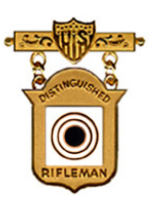
DCM/CMP Distinguished Badge 1959 - Present

While the Marines didn't approve issuing a Distinguished Pistol Badge until 1920, it is interesting to note that the Marine Pistol Leg medals (a legacy from the U.S. Army), even today depict a pair of pistols on their E-I-C Badges that more closely resemble the 1905 Colt Automatic than the M1911 (evidenced by the lack of an apparent manual/thumb safety and a more abrupt "grip-to-slide angle"). This may be simply a case of bad artwork, but on the other hand, the old badges with the stylized semi-automatic pistol may have been an attempt by the Army shooting community to second-guess the Ordnance Corps on the eventual adoption of a semi-automatic