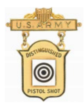
U. S. Army Distinguished Pistol Shot Badge 1959 - Present

Service Pistol. You must remember that the 1905 Colt was one of the initial contenders for consideration as the new service weapon prior to John Browning's final refinements. It is at least possible that the artwork for the new E-I-C badge was accomplished prior to final decision of the Ordnance Folks on <u>which</u> new pistol was to receive the nod. Considering the fair resemblance of the 1905 to the M1911, they may simply have decided to leave well enough alone. This is of course, simply speculation, but the pistols on the Marine Corps Leg Medals very closely resemble the 1905 Colt.