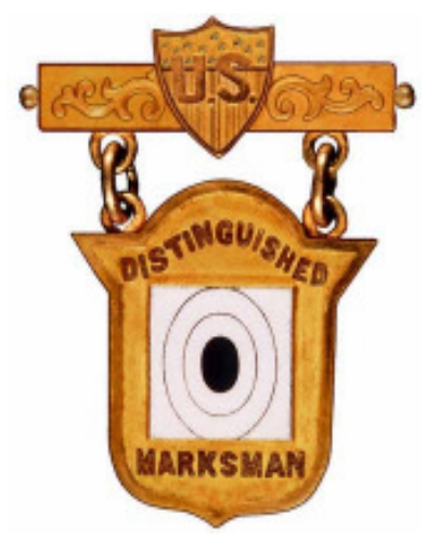
The First Distinguished Badge 1887 – 1903