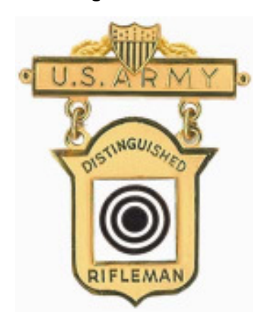
U.S. Army Distinguished Badge 1959 - Present

went with a design that more closely resembles the Army badges currently issued. Conversely, the Marines continued (and still continue) to use the earlier basic round design for both their rifle and pistol legs.